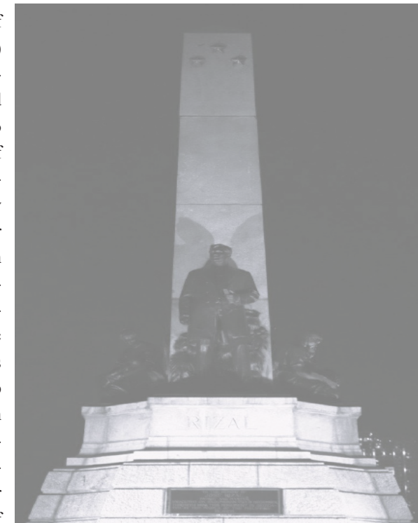
Illumination of the Monument of Dr. Jose Rizal in Green, courtesy of the National Parks Development Committee, to Commemorate the 63rd Anniversary of the Founding of the African Union and Celebrate Philippine-Africa Ties

The Department of Foreign Affairs (DFA) joins the world in celebrating Africa Day, observed annually on May 25 to mark the anniversary of the founding of the Organization of African Unity in 1963 — the forerunner of today’s African Union (AU). This year’s observance marks the 63rd anniversary of that historic milestone and reaffirms the deepening friendship and cooperation between the Philippines and countries of the African continent. In her message for the occasion, Secretary of Foreign Affairs Ma. Theresa P. Lazaro extended her congratulations to the African Union and all its member states, underscoring that the Philippines’ partnership with Africa is anchored on mutual respect, shared values, and a common purpose. She reaffirmed the commitment of the Philippines to work closely, as partner, pathfinder and peacemaker, with African countries in advancing shared aspirations and strengthening cooperation in the years ahead. In observance of Africa Day, a number of key monuments and edifices in Manila, namely the Rizal Monument at Rizal Park, National Museum of Fine Arts and the façade of Fort